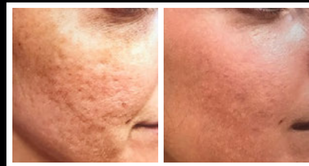
HALO® | 3 MONTHS POST 2 TREATMENTS