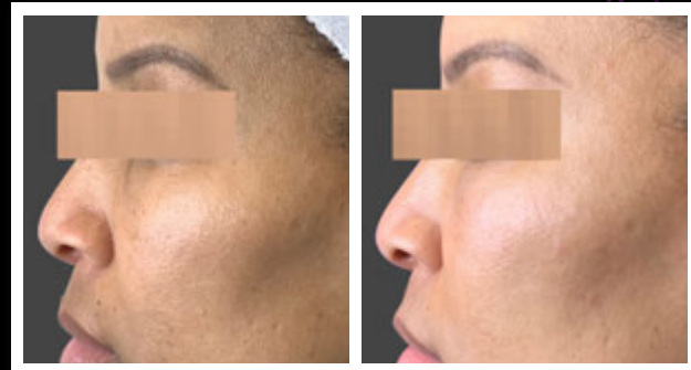
HALO® | 2 WEEKS POST 1 TREATMENT

HALO® restores the glow that sun, time and stress have depleted from your skin.