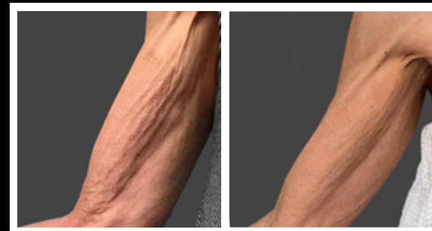
HALO® | 3 MONTHS POST 1 TREATMENT