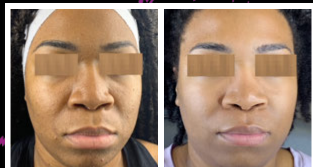
HALO® | 4 WEEKS POST 1 TREATMENT