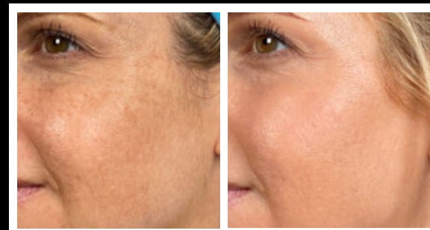
HALO® | 6 WEEKS POST 1 TREATMENT